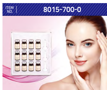
ITEM NO. | 8015-700-0 ALPHA MAX 3.5 PEPTIDES PRICE: 12 BOTTLES - $600