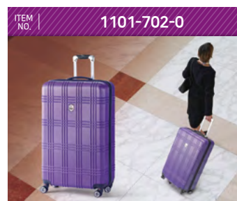
ITEM NO. | 1101-702-0 BIOMAT® PRO CARRY CASE PRICE: $250