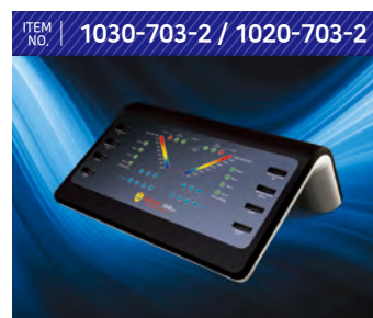
ITEM NO. | 1030-703-2 / 1020-703-2 BIOMAT® CONTROLLER PRICE: KING - $350 / QUEEN - $350