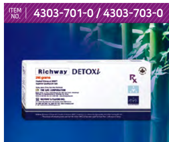
ITEM NO. | 4303-701-0 / 4303-703-0 DETOXI™ PRICE: 1 BOTTLE - $120 / 3 BOTTLES - $250