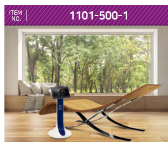
ITEM NO. | 1101-500-1 ZERO GRAVITY CHAIR