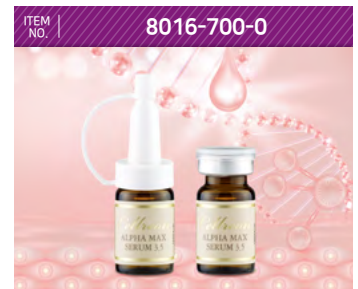
ITEM NO. | 8016-700-0 ALPHA MAX 3.5 EYE SERUM PRICE: $120