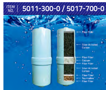
ITEM NO. | 5011-300-0 / 5017-700-0 ALCAL-LIFE™ 7000SL FILTER PRICE: 3000SL - $120 / 7000SL - $120