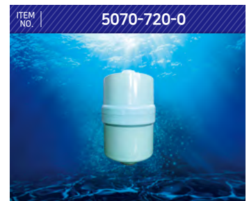
ITEM NO. | 5070-720-0 ALCAL-LIFE™ 7000SL CLEANING FILTER PRICE: $60