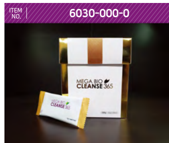
ITEM NO. | 6030-000-0 MEGA BIO CLEANSE 365™ PRICE: 30 PACK - $120