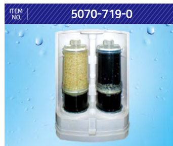
ITEM NO. | 5070-719-0 ALCAL-LIFE™ 7000SL S-FILTER PRICE: $300