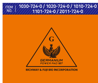
ITEM NO. | 1030-724-0 / 1020-724-0 / 1010-724-0 / 1101-724-0 / 2011-724-0 GERMANIUM POWER PAD 187™ PRICE: KING - $400 / QUEEN - $350 / SINGLE - $250 / PRO - $150 / MINI - $80