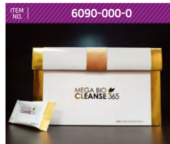
ITEM NO. | 6090-000-0 MEGA BIO CLEANSE 365™ PRICE: 90 PACK - $250