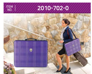
ITEM NO. | 2010-702-0 BIOMAT® MINI CARRY CASE PRICE: $100