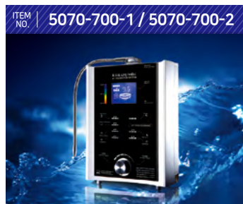
ITEM NO. | 5070-700-1 / 5070-700-2 ALCAL-LIFE™ 7000SL PRICE: $2,500

We believe you will find our products of exceptional quality and receive many health benefits from their use. Our products are in use by thousands of customers worldwide. They enjoy the benefits of improved health through applied scientific techniques, coupled with the ancient wisdom of nature's own resources. The elemental philosophy of Richway & Fuji Bio Inc. has changed lives with miraculous results. The combination of technology and nature is a powerful formula, yielding a healthier and more balanced life.