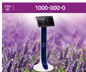
ITEM NO. | 1000-000-0 BIOMAT AROMA STAND™ PRICE: $200