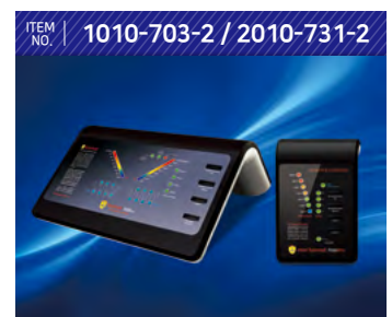
ITEM NO. | 1010-703-2 / 2010-731-2 BIOMAT® CONTROLLER PRICE: PRO - $250 / MINI(DOMED) - $150